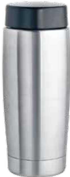
Stainless steel vacuum milk container 0.6 litre