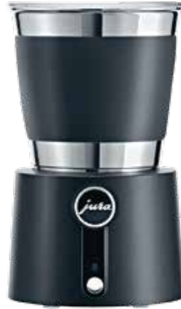
Milk Frother Hot & Cold