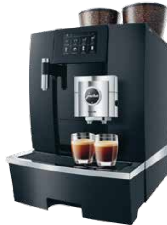
GIGA X8c/GIGA X8, Aluminium Black

The new generation of the GIGA X8c/X8 reflects Swiss innovation and professionalism down to the smallest detail. From intuitive operation with touch technology and 5-star handling to the ultimate coffee quality in the cup, it provides outstanding performance. The GIGA X8 is also four times more professional. Wherever capacities of up to 200 cups a day are required, it delivers quality, functionality and reliability. The result is a high-tech coffee machine that's tailor-made for office floor solutions, seminars, event catering or coffee to go solutions.