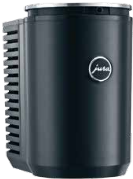
Cool Control 1.0 litre, black Optional accessories: Wireless Transmitter